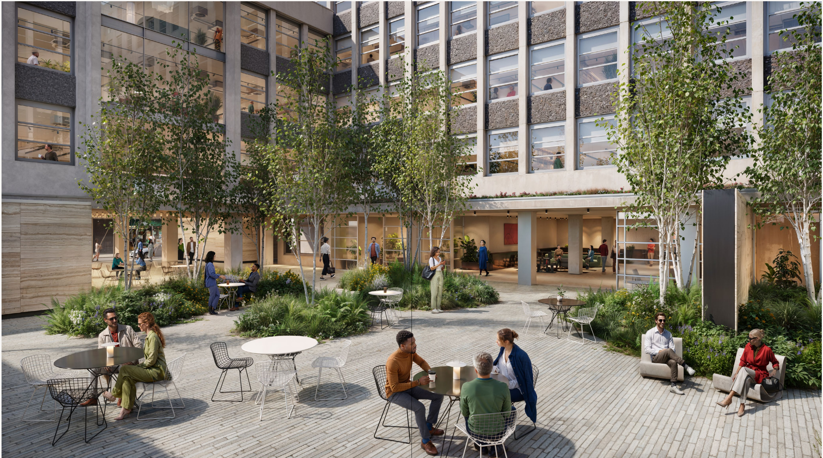
A newly designed courtyard to escape the urban hustle