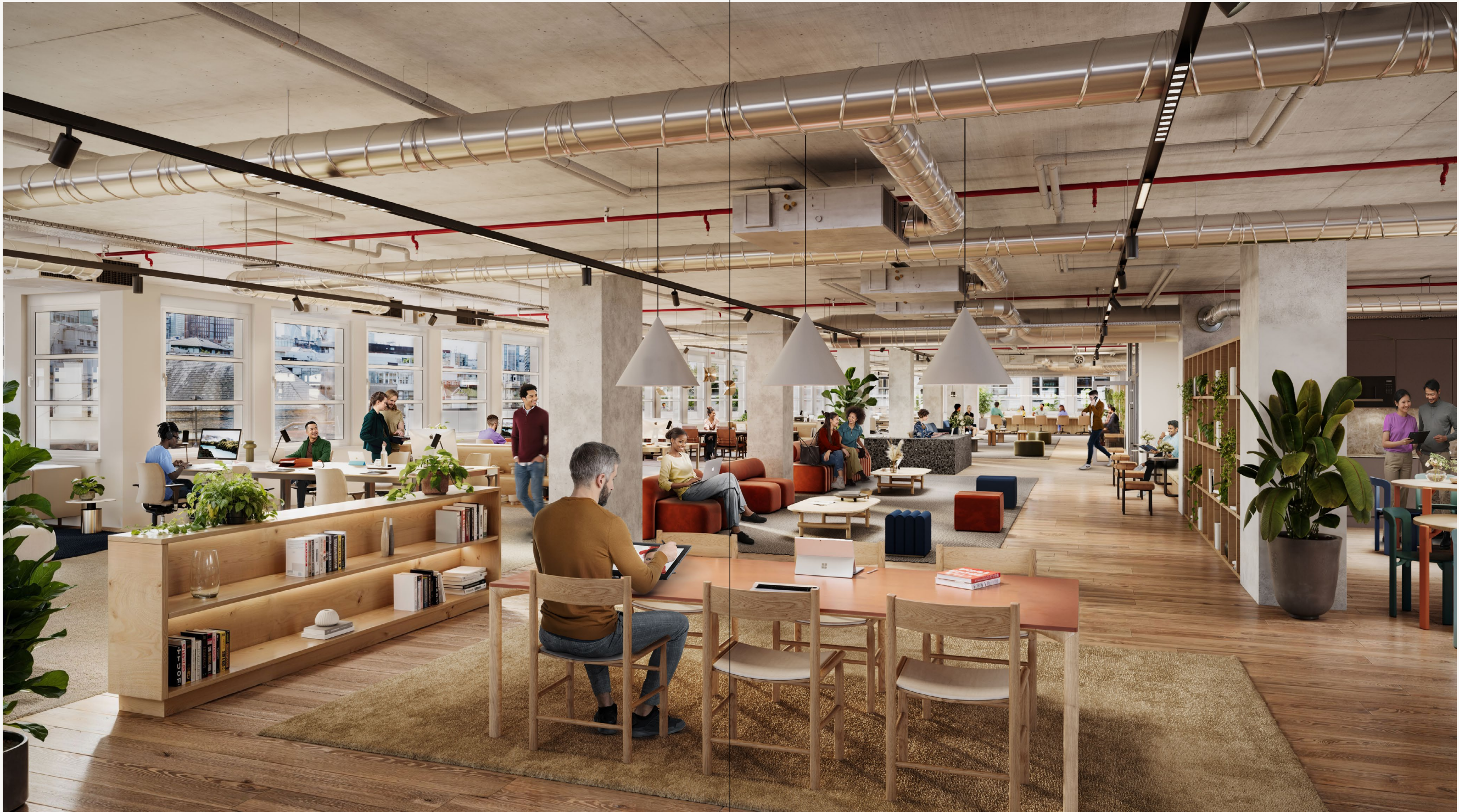
Indicative view of open plan desking and breakout areas