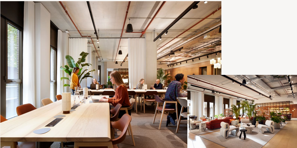
DL/28, 28 Featherstone Street EC1