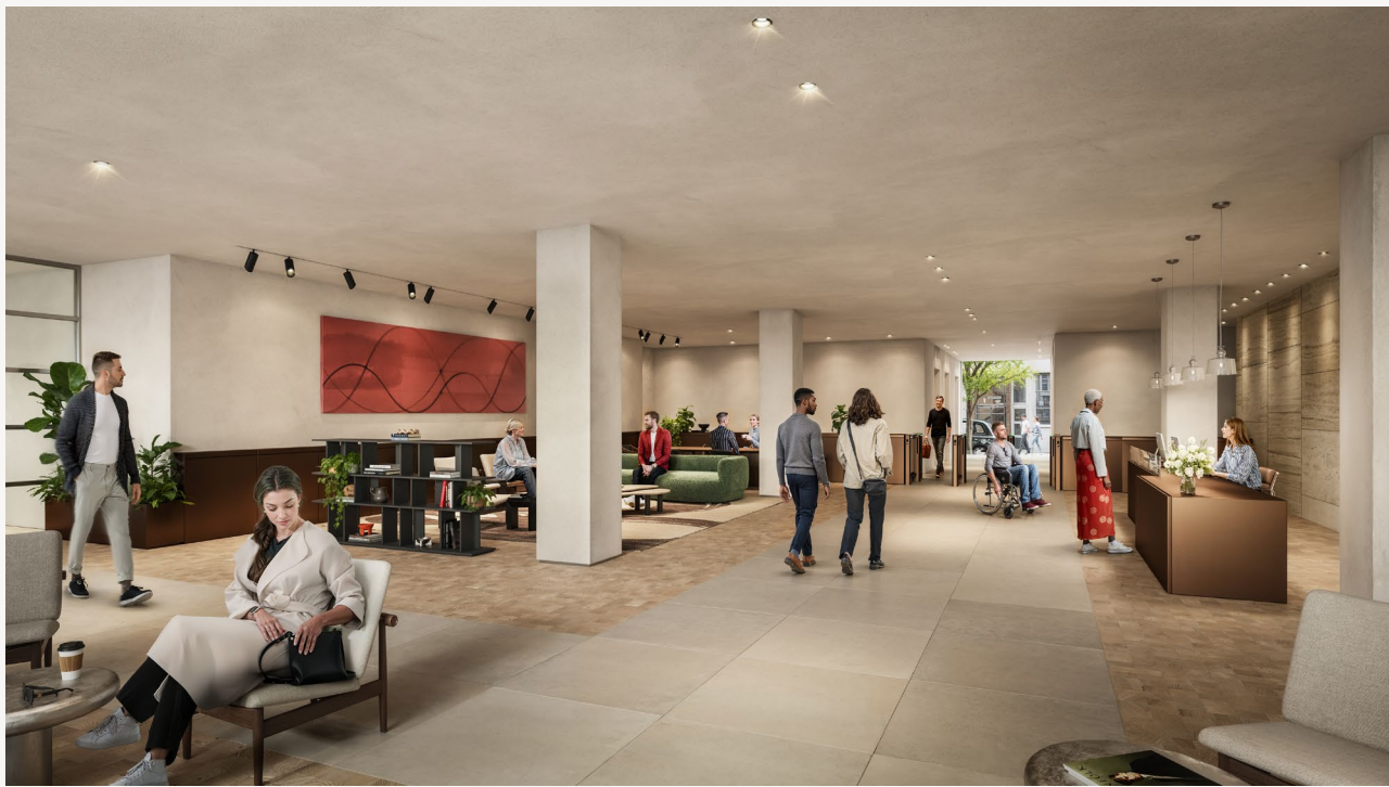
A newly refurbished entrance and contemporary reception lobby

Where work meets tranquillity, your spacious outdoor sanctuary