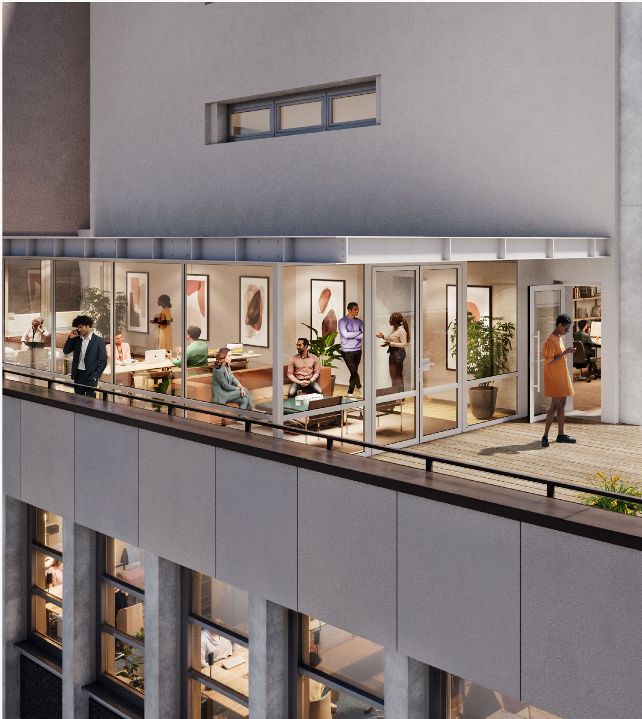
Indicative view of private terrace offering views of the City