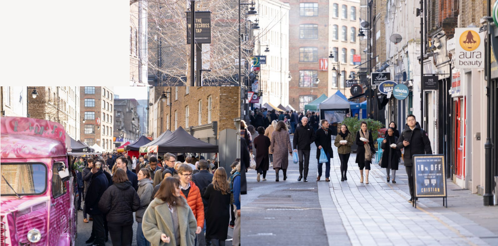
Whitecross Street Food Market

Tasty Street Food Your temptingly close neighbourhood food market on Whitecross Street where you can indulge in delicious food from all over the world.