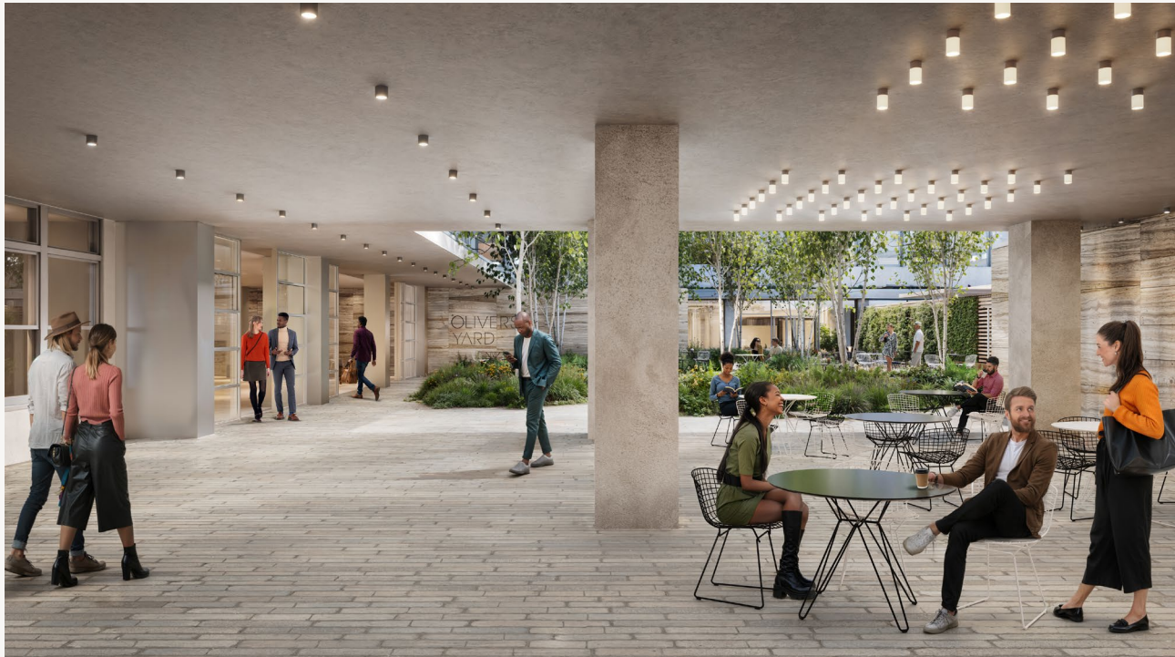
A tranquil arrival through a hidden landscaped courtyard

18,000 sq ft of prime CAT A office space is available on the fourth floor, offering an efficient and flexible floorplate along with a private terrace.