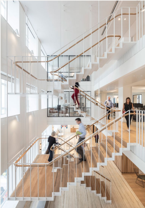
25 Savile Row W1

As a valued tenant of Derwent London, you will automatically enjoy complimentary DL/ Membership status.